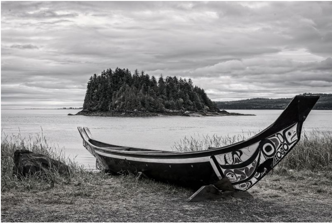
May 2020 Photo Competition Class A Pictorial Second Place: "Ready and Waiting" by Tom Stoeri