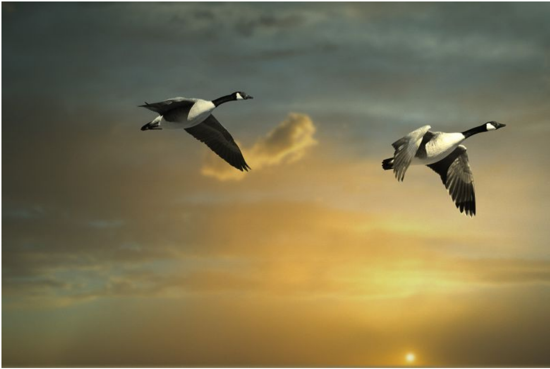
May 2020 Photo Competition Class A Nature Second Place: "Away We Go" by Ivan Bub