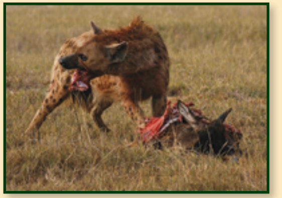
Hyena Eating Wildebeest