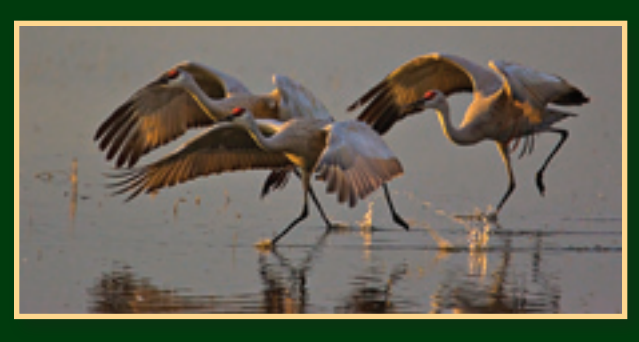
Cranes Taking Off