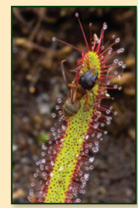
Ant Captured by Sundew