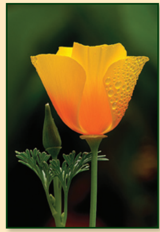
Dewey California Poppy