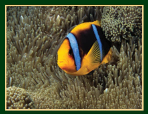
Amphiprion Chrysopterus © Steven Fisher